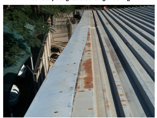
Angled barge flashing causing water ingress