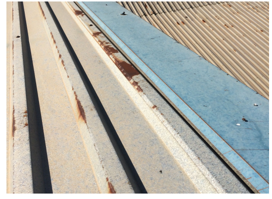
Incorrectly designed Steel barge flashing

For the long term performance of the barge detail, it is essential that all components are installed correctly. Should any of the components such as sealant tape or zed support be omitted then water will enter the detail.