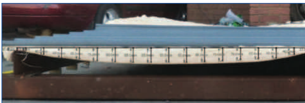
Physical mock-up with measured tapered compression.

Per the prescriptive route of compliance, SANS10400-XA stipulates that a prescribed minimum total R-value be achieved based on the building classification and geographical location. These minimum requirements are unfortunately not being achieved in a large majority of new buildings being constructed in South Africa, due to compression caused by incorrect installation methods. And this has hugely negative ramifications on the overall energy efficiency and associated operational costs incurred over the life cycle of the building.