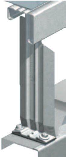
Ashgrid™ bracket and bar.

Mechanical spacer systems, such as the Ash & Lacy Ashgrid™ system, are engineered to perform as structural components of the roof assembly and are used to eliminate compression of the insulation blanket whilst taking the guesswork out of roof assembly connections.