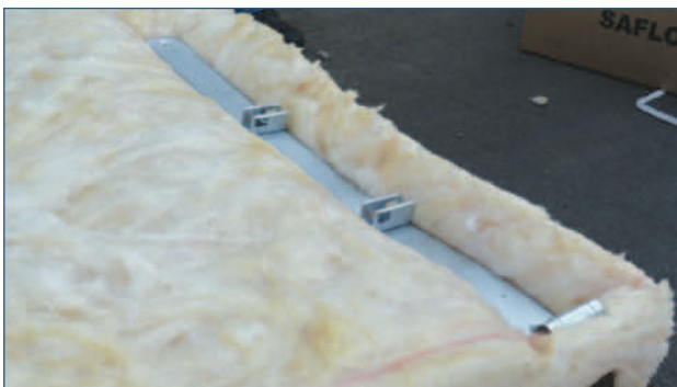
Misaligned concealed fix clip caused by compressed insulation.

Compressed insulation can also result in reduced performance of the outer weather sheet, especially when the highly preferred concealed fix profiles are utilized.